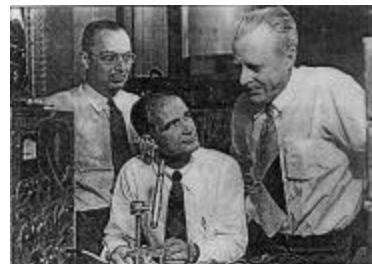
John Bardeen, William Shockley and Walter Brattain